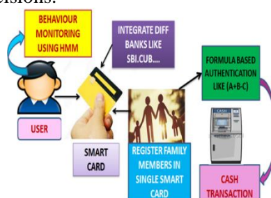
Figure.1. System Architecture

The impact of security and scalability of cloud service on supply chain performance: Cloud computing introduces flexibility in the way an organization conducts its business. On the other hand, it is fitting for associations to choose cloud benefit accomplices in view of how set they up are owing to the uncertainties present in the cloud. This study is a conceptual research which researches the effect of some of these vulnerabilities and adaptabilities adorned in the cloud. First, we look at the assessment of security and how it can impact the supply chain operations utilizing entropy as an Assessment instrument. In view of lining hypothesis, we take a gander at how versatility can moderate the relationship between cloud service and the implied benefits. We mean to demonstrate that cloud administration can just demonstrate useful to supply partners under a highly secured, highly scalable computing environment and hope to loan assurance to the requirement for framework thinking and in addition key speculation when making cloud service adoption decisions.